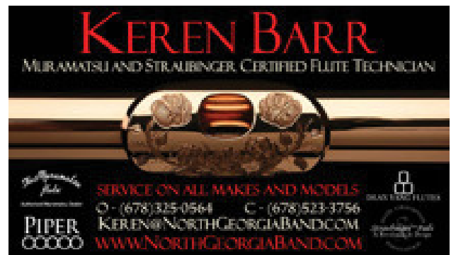
AFC Spring event sponsored by North Georgia Bands