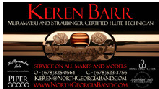
AFC Spring event sponsored by North Georgia Bands