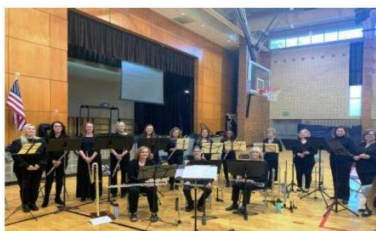
Fayette Area Flutist