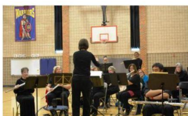
Flute Choir of Atlanta