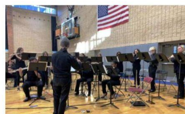
Mercer University Flute Choir