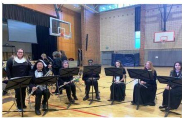
GYSO Flute Choir