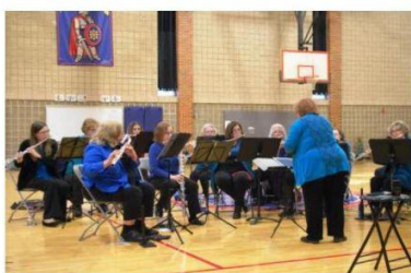
Atlanta Flute Ensemble