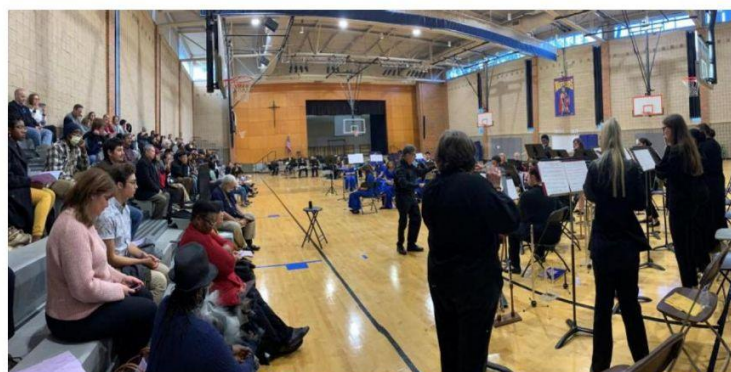
Combined Choirs Playing "America the Beautiful" arr. Kelly Via

Watch for details about Flute Choir Extravaganza November 2023.